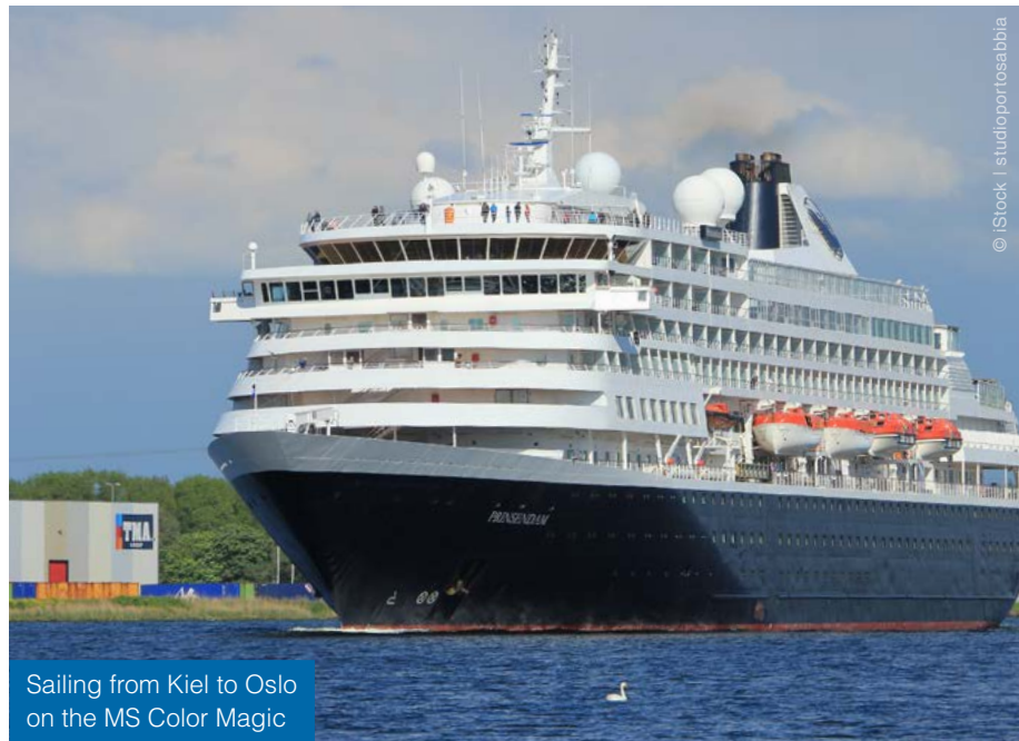
Sailing from Kiel to Oslo on the MS Color Magic

The focus of the meeting was on the integration of the foreign subsidiaries with a view to the further expansion of our international activities.