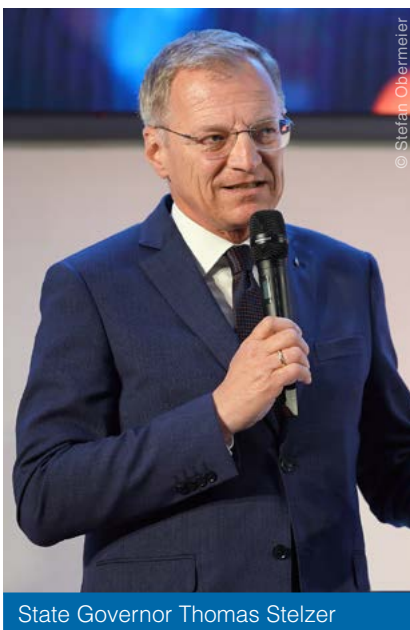
State Governor Thomas Stelzer

This year, the focus was on the region of Upper Austria, for which Thomas Stelzer, State Governor of Upper Austria, delivered the keynote speech. Austria continues to be one of Bavaria's most significant trading partners. HEITEC has maintained a successful presence in Austria with a local subsidiary since 2010..