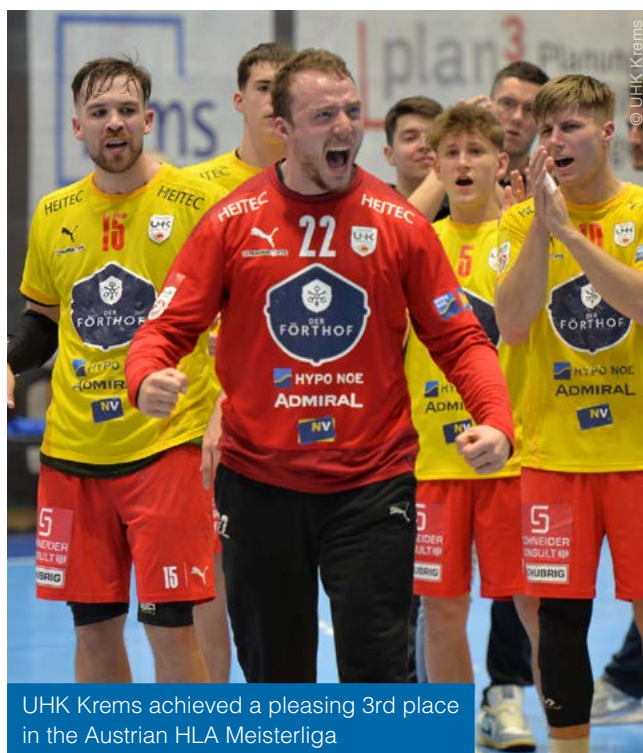
UHK Kreams achieved a pleasing 3rd place in the Austrian HLA Meisterliga