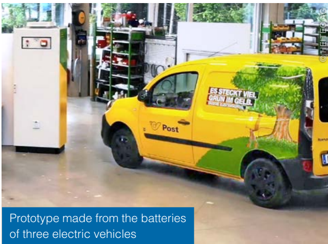
Prototype made from the batteries of three electric vehicles

HEITEC Innovations is working for Österreichische Post AG on the development and construction of 2nd-life battery storage systems from used vehicle traction batteries. The battery storage systems can store surplus energy from the photovoltaic systems of the Austrian Post AG in order to improve the self-consumption rate, to expand the fast-charging infrastructure and to smooth out peak loads during electricity consumption.