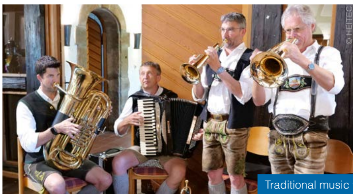
Traditional music from the "4 Hinterberger Musikanten" band