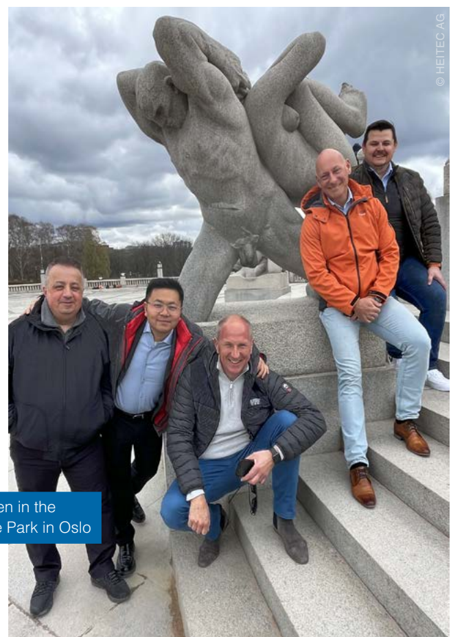
Our strong international men in the famous Vigeland Sculpture Park in Oslo

Besides the conference, the group toured Oslo, visited the Holmenkollen ski jump, the polar research vessel Framm and Norwegian sculptor Gustav Vigeland's world-famous sculpture park. The park was created between 1907 and 1942 and features 212 stone and bronze sculptures.