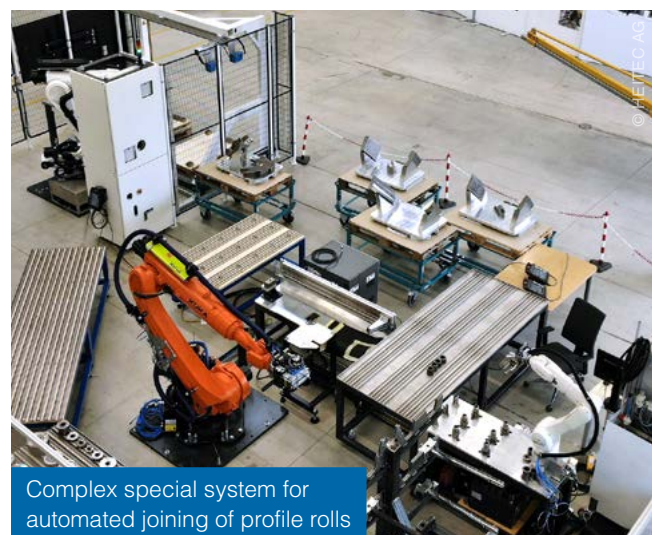
Complex special system for automated joining of profile rolls

Also on display was the Shaft Joining Cell for the Welsler Profile project. The new cell enables fully automatic recognition of profile rolls, as well as storage and loading of shafts with rolls and spacing. This simplifies a complex process and minimizes potential errors.