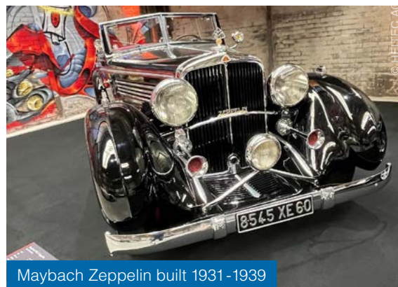
Maybach Zeppelin built 1931-1939

The HEITEC Supervisory Board took the opportunity to hold its meeting in the rooms of the automobile museum. Afterwards, visitors were able to admire exhibits from brands such as Bugatti, Bentley, Mercedes, Maybach and Ferrari. The exhibition vividly depicts the history of the automotive industry over almost 100 years.