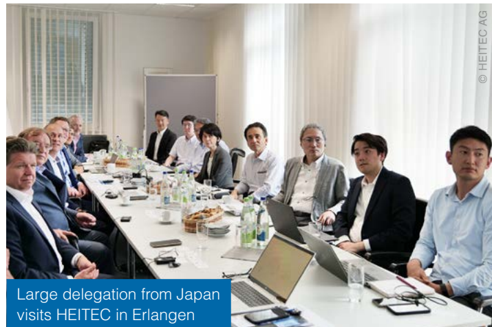
Large delegation from Japan visits HEITEC in Erlangen