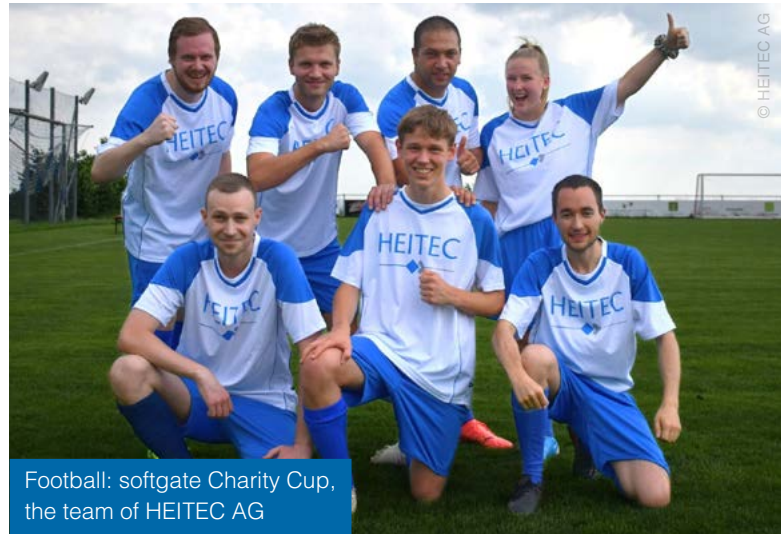
Football: softgate Charity Cup, the team of HEITEC AG

The subsidiary softgate organized the Charity Football Cup again this year. On June 28, a total of five teams competed against each other in an exciting tournament. The HEITEC AG team took 2nd place; HEITEC Innovations GmbH received the trophy for the “Winner of Hearts”. We are looking forward to the next tournament next year.