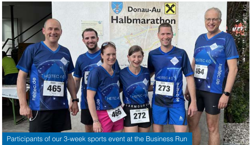
Participants of our 3-week sports event at the Business Run