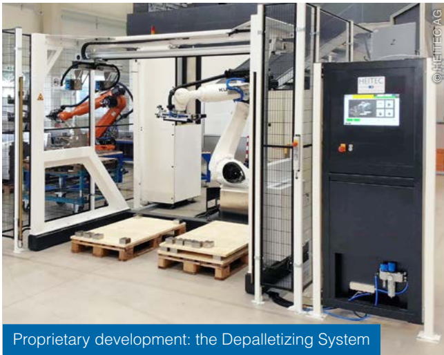
Proprietary development: the Depalletizing System

With the depalletizing system developed in-house, we demonstrated our expertise in the field of special machine construction and gave the audience a live experience of the advantages of digital solutions.