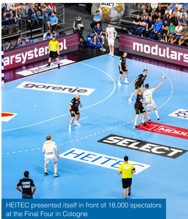
HEITEC presented itself in front of 18,000 spectators at the Final Four in Cologne