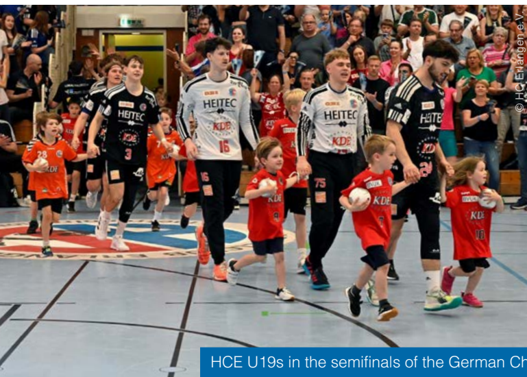
HCE U19s in the semifinals of the German Championship