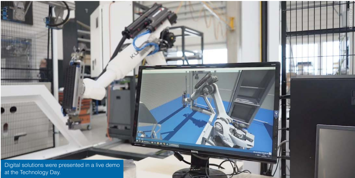
Digital solutions were presented in a live demo at the Technology Day.

engaging lectures and live demonstrations. We had the privilege of welcoming over 60 leading companies to the event.