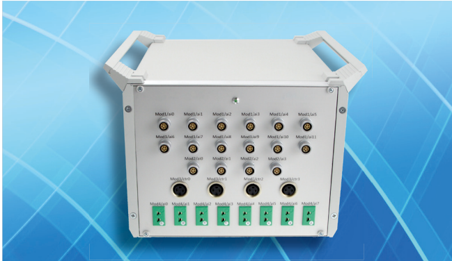
Front panel of the mobile measurement data recording system, with the connections for the different measuring modules